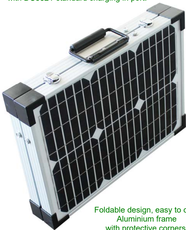
Foldable design, easy to carry Aluminium frame with protective corners

The Python comes with an integrated charge controller with built-in USB output. Besides this, the Python includes a 5 metre total length cable incorporating a 4 metre cable with cable clamps and charging cable and a 1 metre length cable with DC5521 adapter output to charge powerstation with DC5521-standard charging in port.