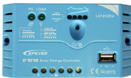
Integrated controller with USB output