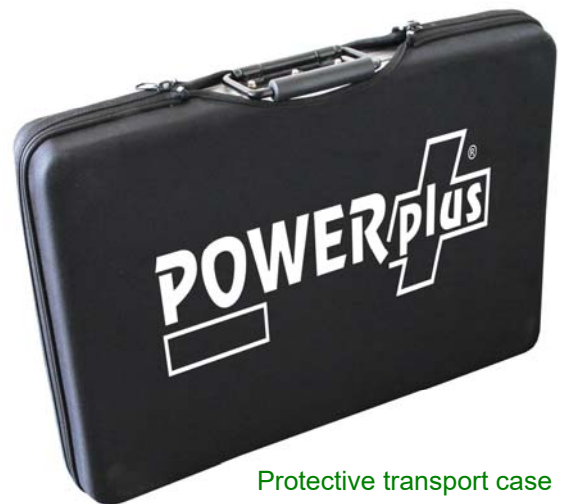
Protective transport case